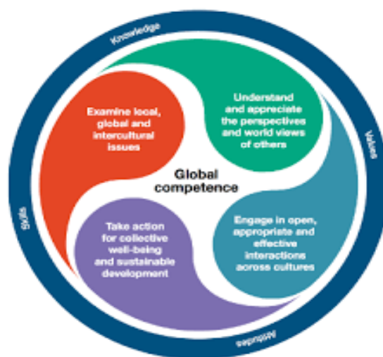
Fig. 1 Global Competency Framework (OECD, 2018, p.11)

In 2018 the OECD came up with the Programme for International Student Assessment (PISA) framework which is a multi-dimensional construct that requires a combination of knowledge, skills, attitudes, and values applied to 4 key dimensions Dimension 1: Examine local, global, and intercultural issues. Dimension 2: Understand and appreciate the perspectives and worldviews of others. Dimension 3: Engage in open, appropriate, and effective interactions across cultures. Dimension 4: Take action for collective well-being and sustainable development. (PISA 2018 Global Competence.)