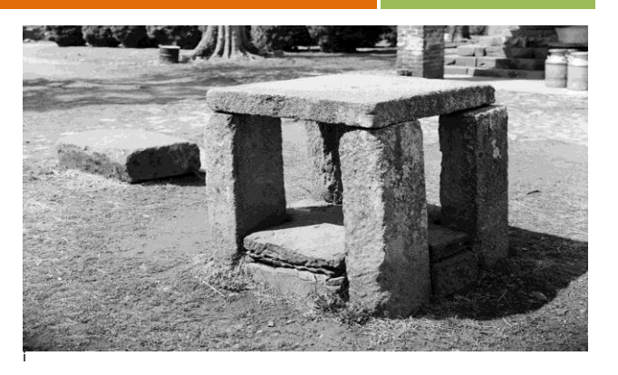
(Slave Auction Block, Green Hill Plantation, Virginia)