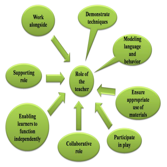
Figure 3. the role of teacher in the use of drama (adopted from Bennett, N, Wood, L. & Rogers, S., 2001)

professional training and restricted opportunities in innovative approaches.