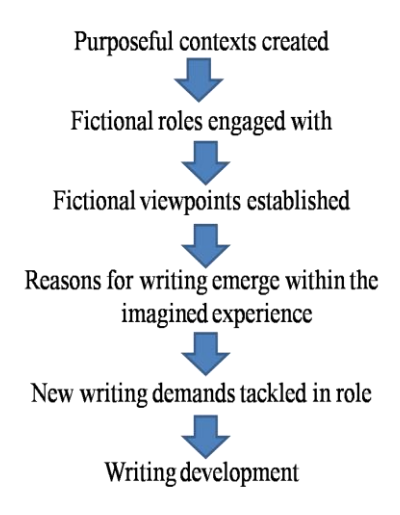
Figure 4 Writing through drama (adopted from Baldwin, P. & Fleming, K., 2003)

Creative guided writing activity: in this task, more advanced learners draft a script that will be used for dramatization in the later stage. It is a choice for the less advanced learners in rewriting and performing dialogues or situations. It can be explained lucidly in the figure 4.