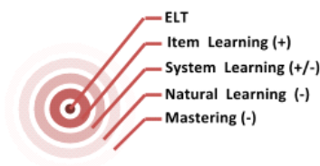
Figure 1. The Status of Learning and Mastering English in Libya

It goes without saying that English is the most preferred lingua-franca globally. Today, the number of non-native speakers of English is more than the native speakers of the language (Chen, 2009). But English in Libya is undoubtedly in deplorable condition for many reasons. Despite the intense need for learning English for the social and economic development of the country, average Libyan harbours a misconception that English can never be a crutch to survive in Libyan society. The linguistic obsession of Libyans towards their mother tongue (Arabic) has deprived Libyan learners of mastering English language adequately and appropriately. Using dichotomous binary variables: (+) and (-) representing presence and absence respectively, the following figure-1 illustrates the state of learning and mastering English in Libya (Jha, 2014-A).